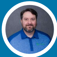
Scott Hall Student Transportation